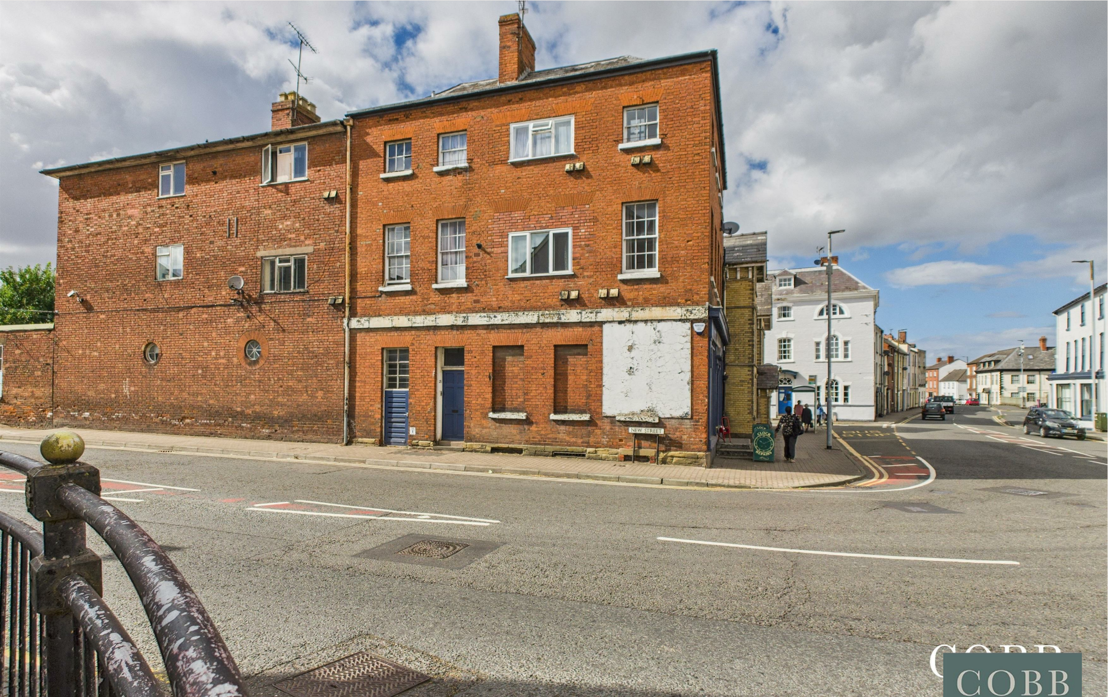
Flat 1 Highbury House, Broad Street, Leominster, HR6 8BT Price £115,000